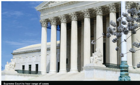
Supreme Court to hear range of cases

By Bill Myers , CNN Supreme Court Producer updated 2:19 AM EST, Mon October 3, 2011